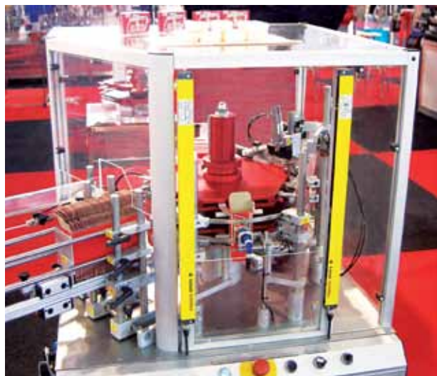
Noise Control Enclosures

Manufactured with a unique hard coat surface which is applied to both sides, Safeguard Hard provides excellent scratch, chemical and graffiti resistant properties.