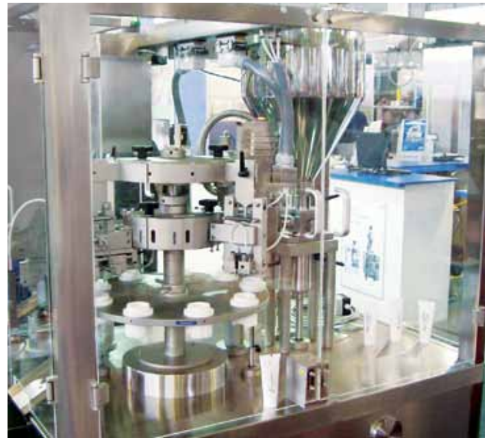
Optically Clear Safety Guards